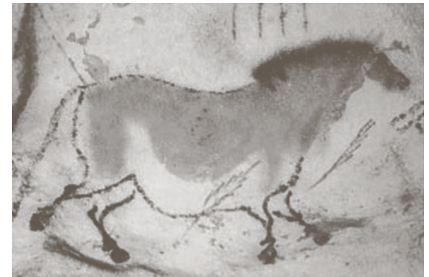
A cave painting from the French Lascaux caves which contain 16,000-year-old Paleolithic art.

You belong to haplogroup R1b , The Artisans, who first arrived in Europe from west Asia about 35,000-40,000 years ago at the dawning of the Aurignacian culture. This culture was remarkable for its subtle, yet significant, technological progress. While early